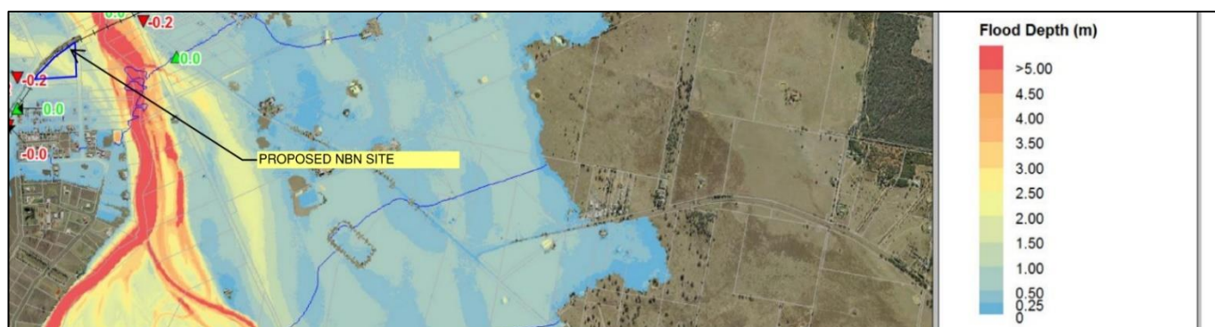
Figure 4 Flood Map Extract

Flood mapping indicates the subject land is at risk of flood from the nearby Narrabri Creek. Flood depth varies across the subject land (particularly through the central section where the dam is located), with the selected location at less risk, as indicated on the map extract below.