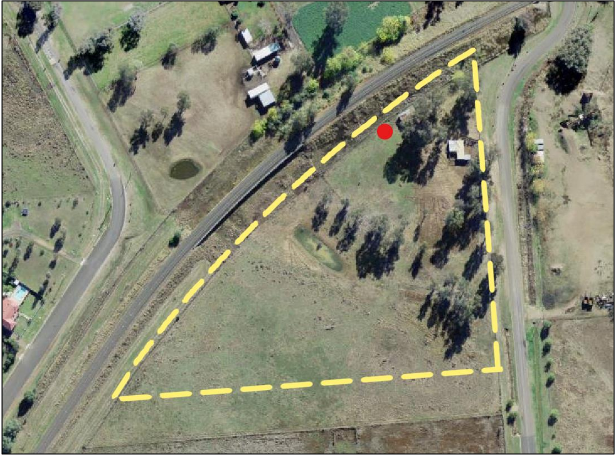
Figure 3 Site Map

The subject land is a roughly triangular-shaped allotment on the western side of Guest Street. Most of the land (including the location of the proposed facility) is located within the RU1 - Primary Production Zone, with the south-western corner within the R1 residential zone. The railway line along north-western side of the subject land is zoned for rail infrastructure (SP2).