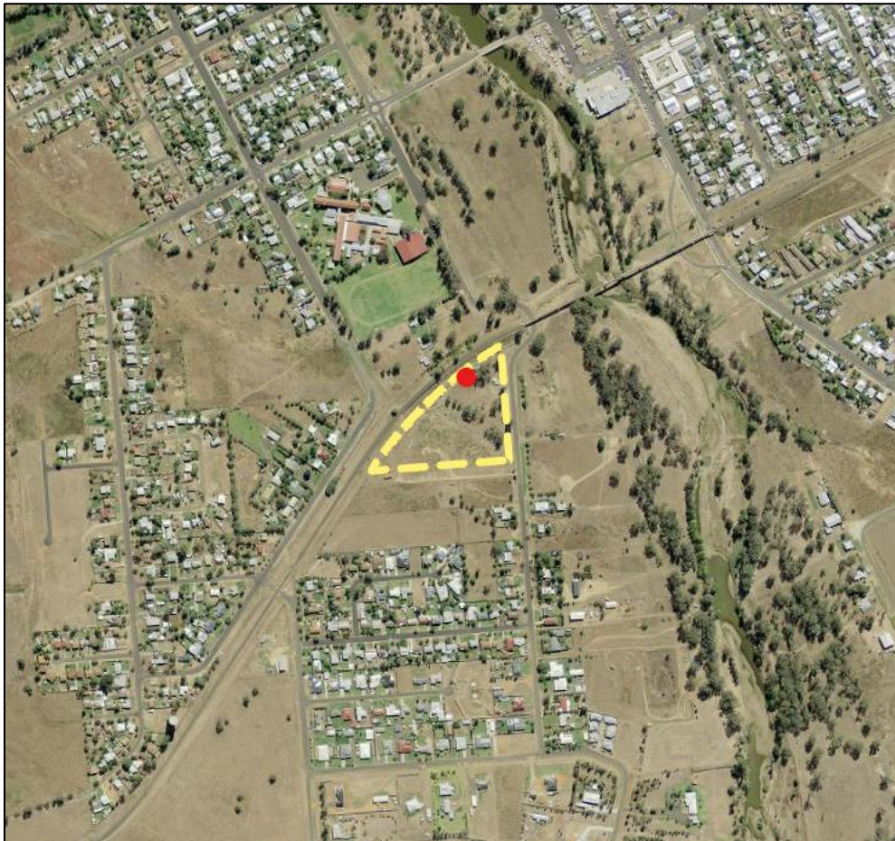
Figure 2 Locality Map

The telecommunications facility is proposed to be located at 57 Guest Street, Narrabri, as indicated by the red dot on the aerial image below. The location is on the south-western outskirts of the Narrabri township to the west of the Narrabri Creek.